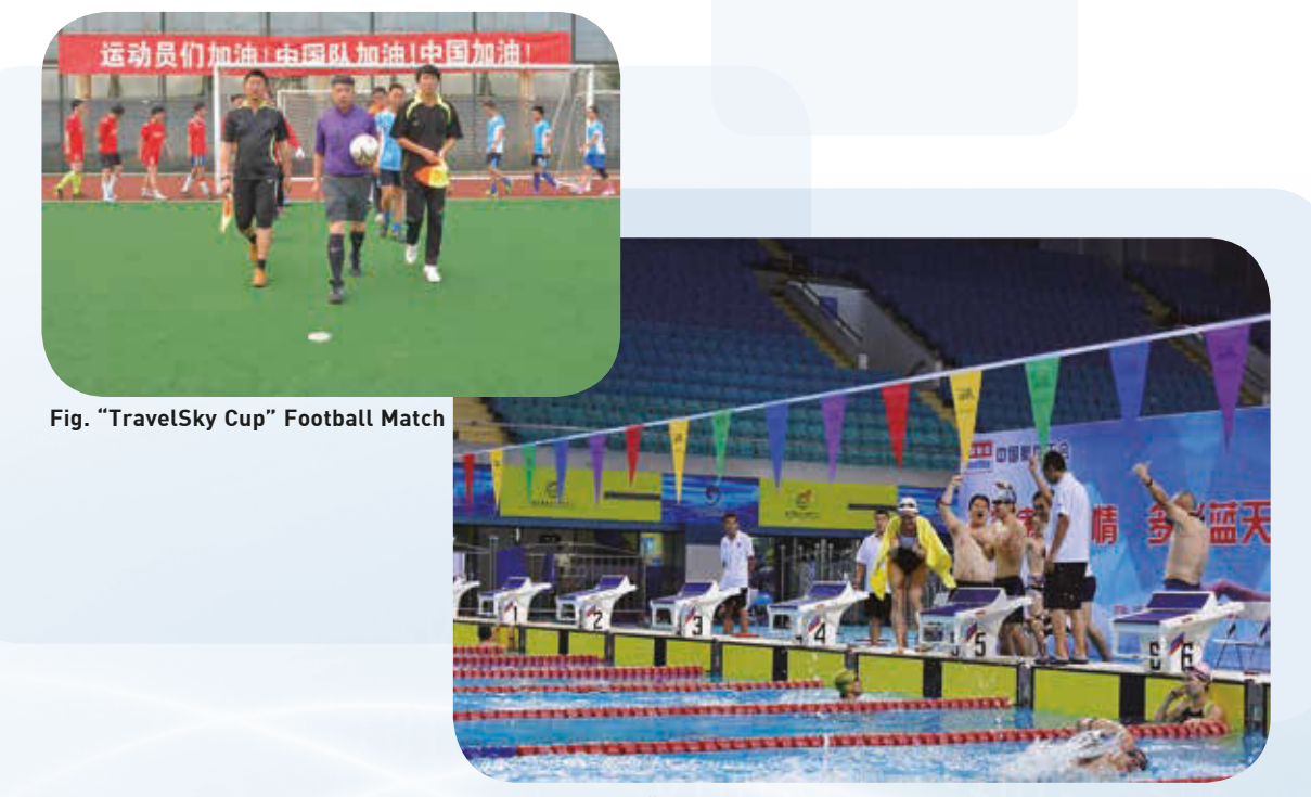
Fig. "TravelSky Cup" Swimming Match