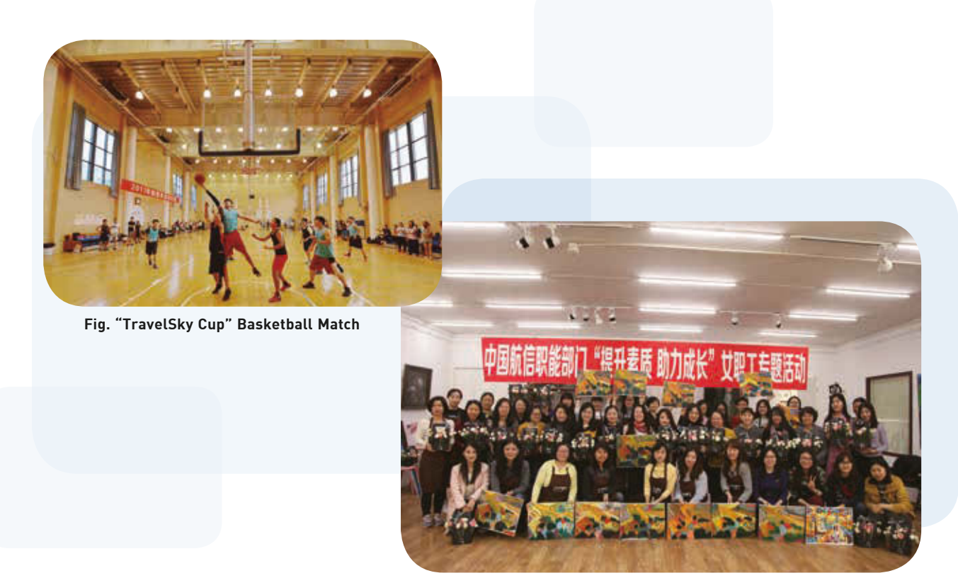
Fig. Special Activities for Women Employees